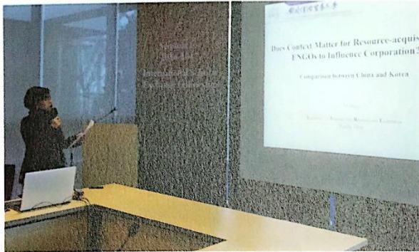
ISEF Academic Seminars