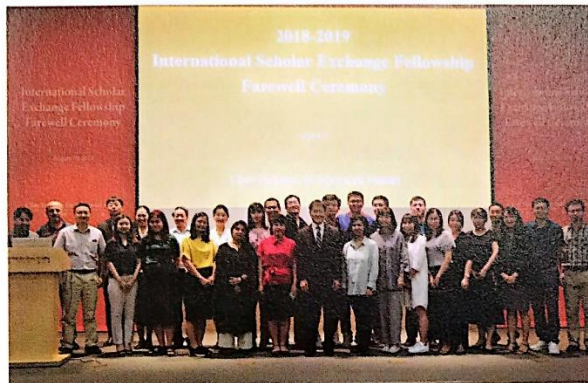
ISEF Farewell Ceremony