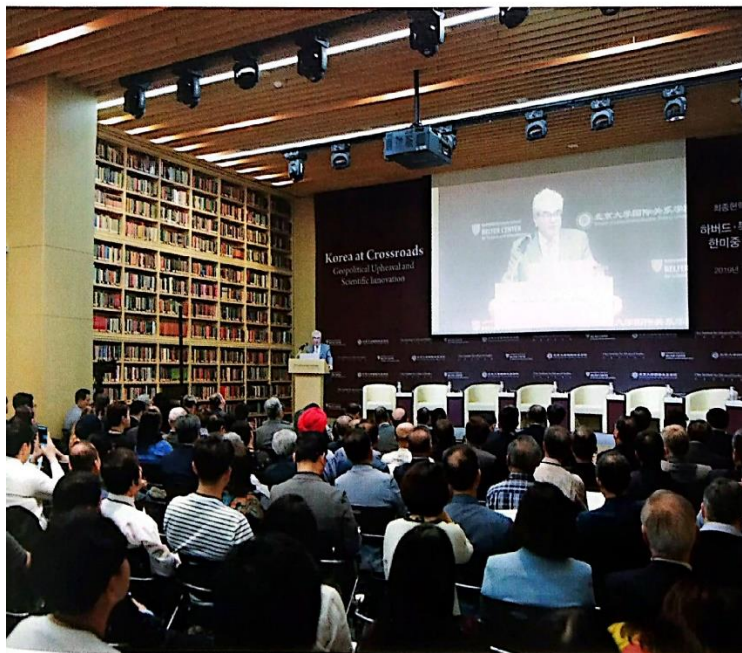
ROK-US-China Trilateral Conference

The Chey Institute supports the following international academic exchange programs.