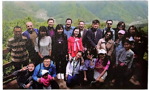
Visit to Afforestation Plant