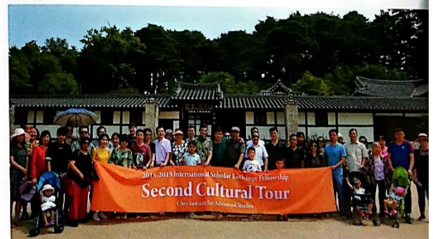
ISEF Cultural Trip