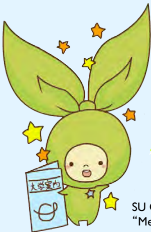
SU Official Mascot "Merin-chan"

We are looking forward to seeing you in Saitama!